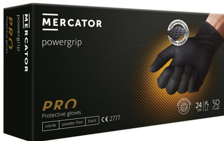
MERCATOR powergrip (black)